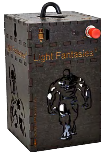
Franceska Mortimer Finalist: Project 3 Light Fantasies