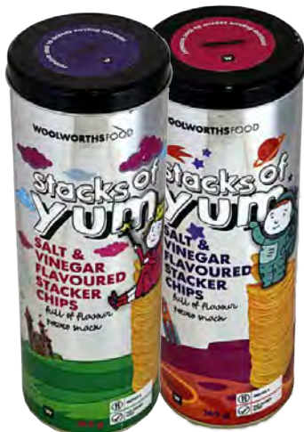
Mishkah Samie Finalist: Project 1 Stacks of Yum Potato Snack